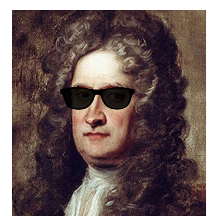
Raising the Temperature on Extreme Heat: